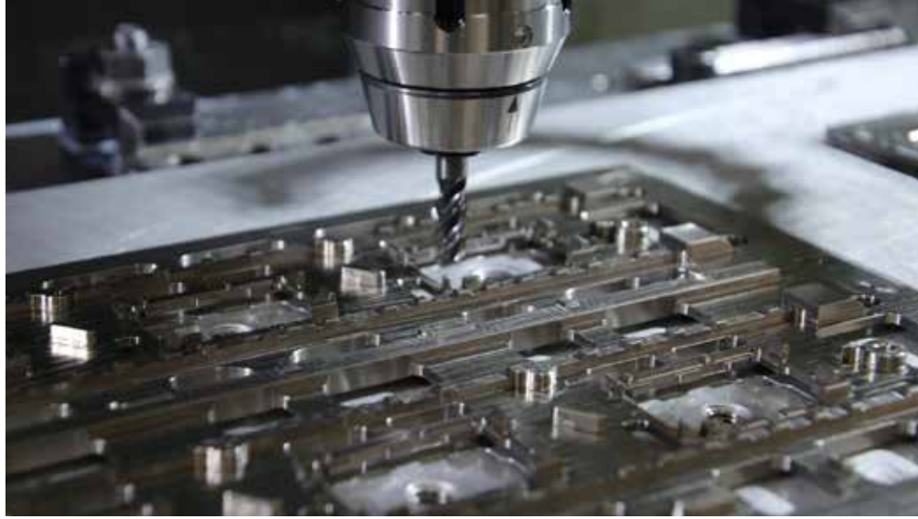
Machining process: High accuracy and precision with Mitsubishi Materials VQ series of end mills