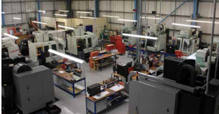
Formagrind: Machine shop milling section

Tel: +44 1827 312312 E-Mail: sales@mitsubishicarbide.co.uk Web: www.mmc-hardmetal.com www.mitsubishicarbide.com